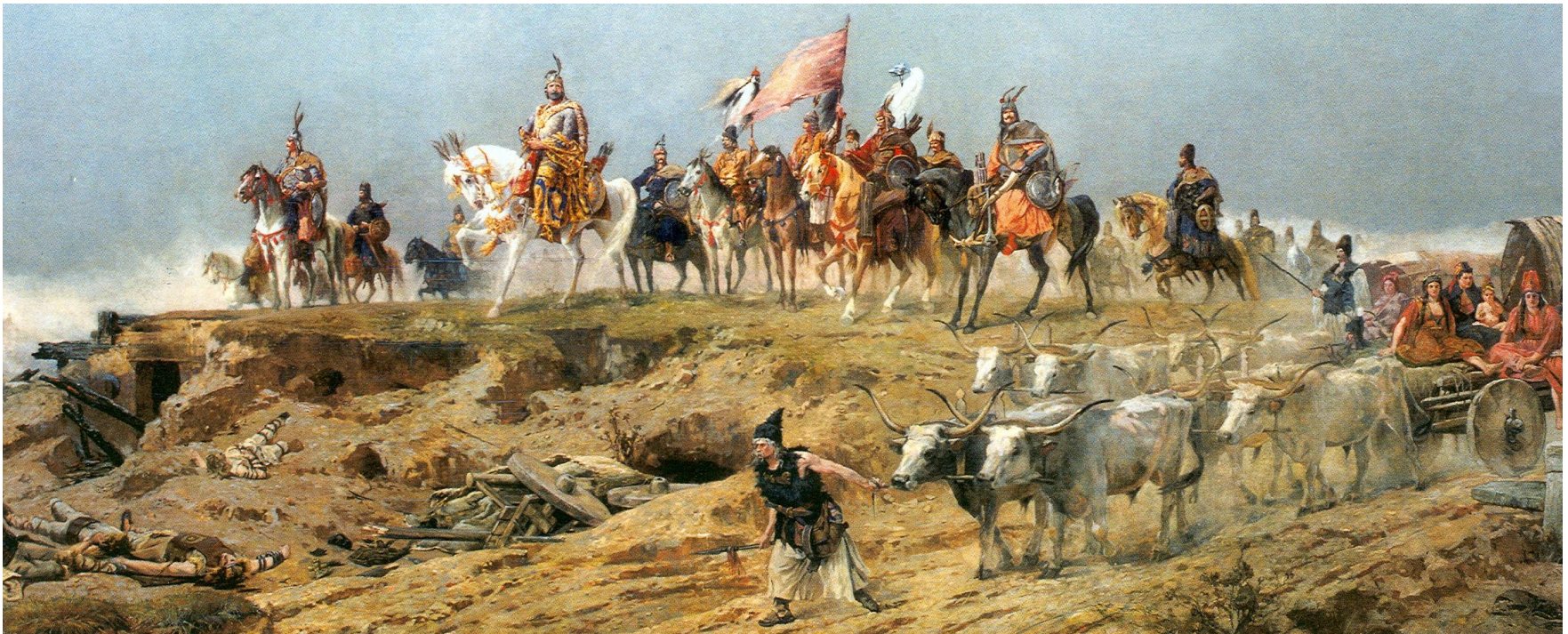
Árpád Feszty: Arrival of the Hungarians, 1894